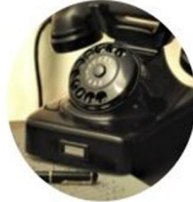
Counseling and information