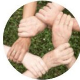
Stay in contact